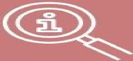
Finding missing information